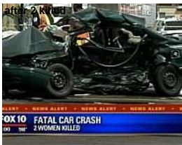
FOX 10 FATAL CAR CRASH 2 WOMEN KILLED