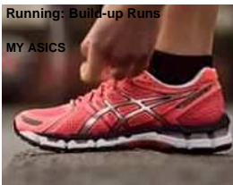
Running: Build-up Runs MY ASICS