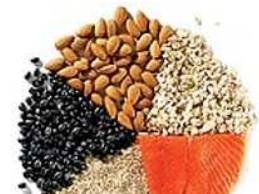
10 Most Filling Foods for Dieters