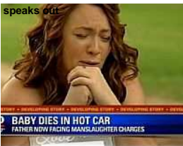
BABY DIES IN HOT CAR FATHER NOW FACING MANSLAUGHTER CHARGES