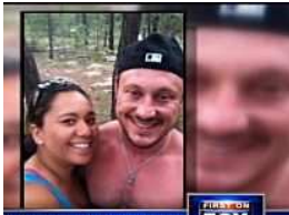
Hiker's future wife witnesses fatal fall off Mongollon Rim